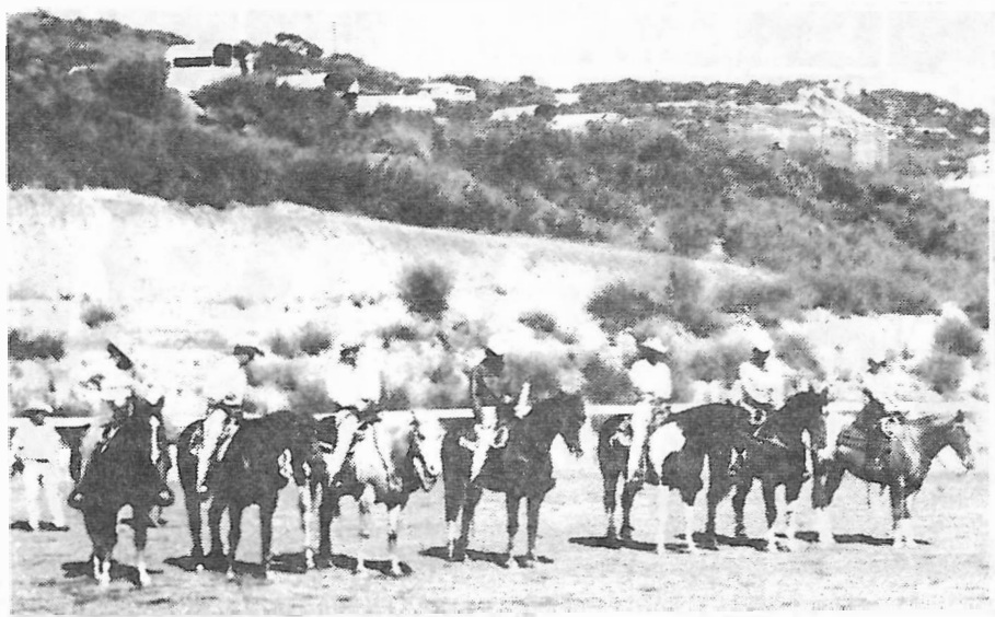
HERE are 7 of contestants during one class at Viejas Days horseshow at YC ring. Cars and horse trailers were crowded on play area of school above. Everyone had a fine time.

"How's that?" asked his friend. "Well, when I proposed to her I had to yell so loud that the girl across the road is suing me for breach of promise."