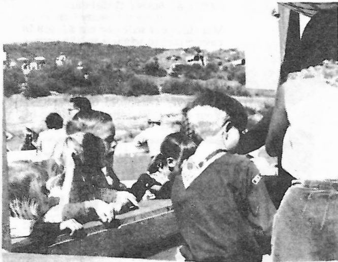
Extra lovely weather favored the horseshow which made the cold drink booths enjoy a fine business as shown here where young fry wait to be served.

"Dad, what would you have if there were five female hogs and five male deer in a pen?"